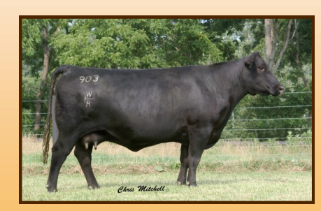
WTR Miss Traveler 903 Matriarch Lot 9 & 24