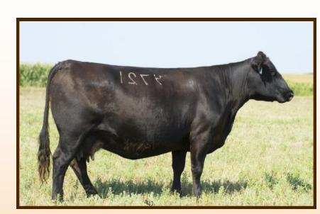
LC Lucinda 9721 Dam of Lot 13