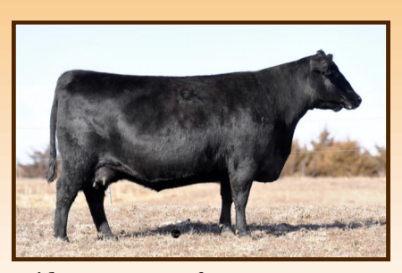
B-R Pride 1551 Dam of Lot 5

Generations of Proven "Bull Maker Moms" take the Guesswork out of Bull Selection.