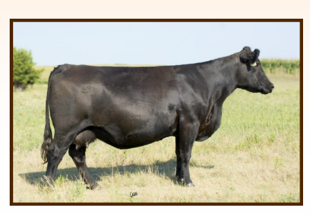
LC Barbarae X698 Dam of Lot 28